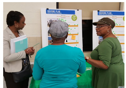
Residents and community partners reviewed the early design concepts for neighborhood transformation, and voted on various topics.