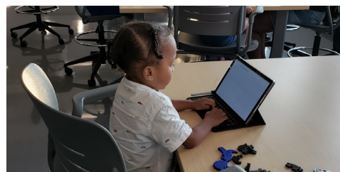
Interested in the classes? See the event calendar at bit.ly/BCIOC .