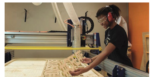
Images: Youth participating in STEM activities. All ages are encouraged to use this neighborhood amenity.

Cover photos: Images of BCIOC and youth engaged in various activities at the center. These activities are designed to give youth hands-on experience with science, technology, engineering and mathematics [STEM]. Exposure to STEM at early ages open opportunities for youth to enter into these career fields as adults.